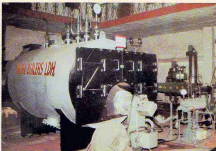
OIL / GAS FIRED BOILER